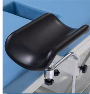
ADJUSTABLE LEG SUPPORT