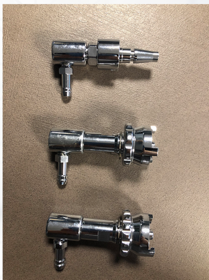
Medical Gas Outlets